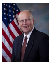
Ward #1 Ward #2 Ward #3 Ward #4 Ward #5 Clerk-Treasurer