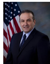
kschoon@munster.org lmellon@munster.org cgardiner@munster.org tulo@munster.org drkoul63@gmail.com wmis@munster.in.gov