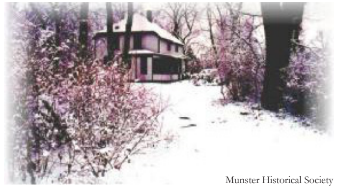
Munster Historical Society