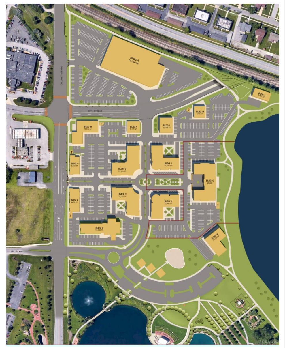
Modified and approved within the red line – November 20, 2023