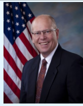
Ward #1 Ward #2 Ward #3 Ward #4 Ward #5 Clerk-Treasurer