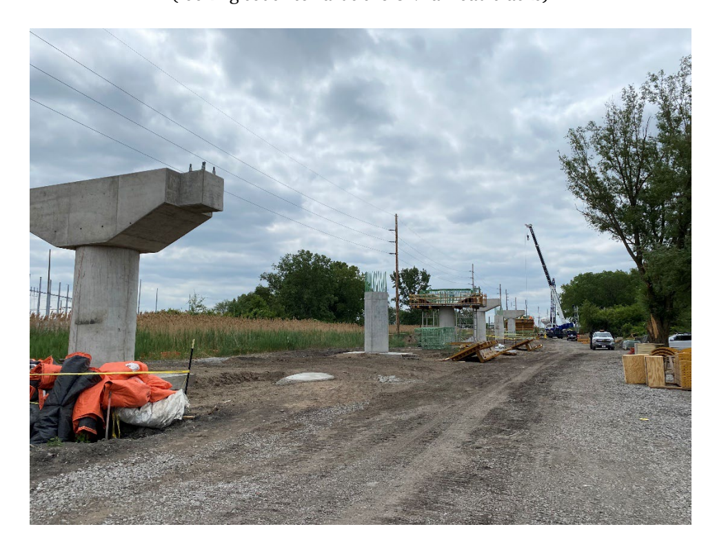
Elevated structures for the flyover over CNRR and 45^{\rm th} Street (looking south towards the CN railroad tracks)