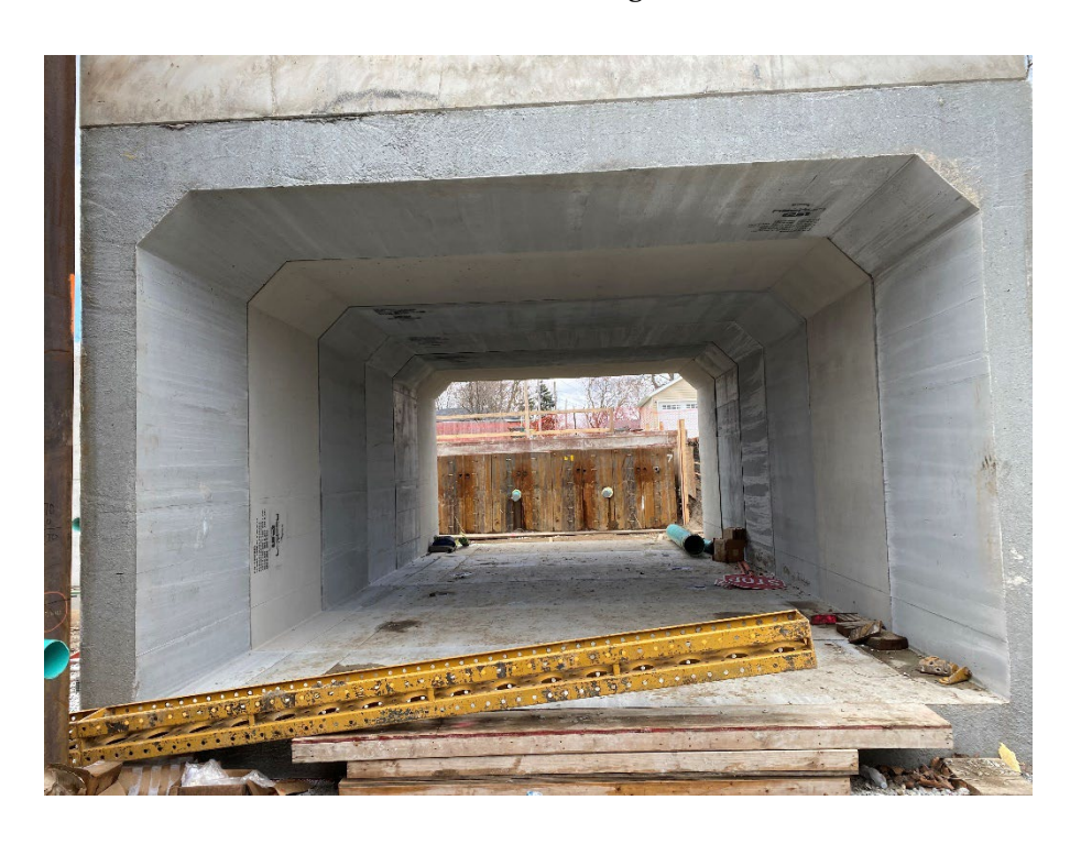
Another view looking west

Side view of tunnel. This area will be backfilled with sand and the tracks will be installed over the tunnel.