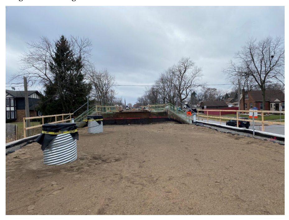
Looking south from Broadmoor bridge