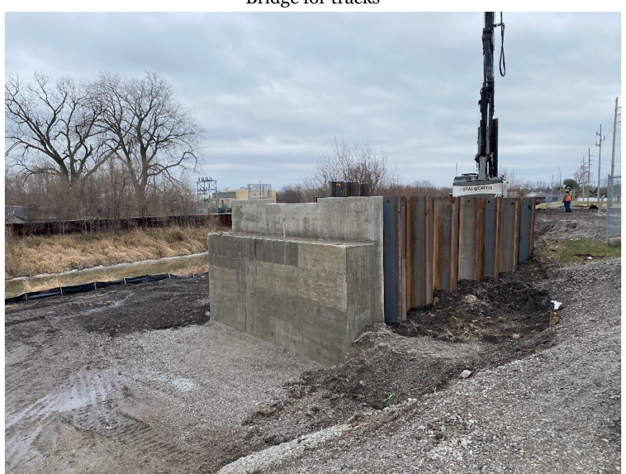
Tracks on left, pedestrian bridge on right