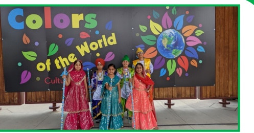
Colors of the World Culture Fest