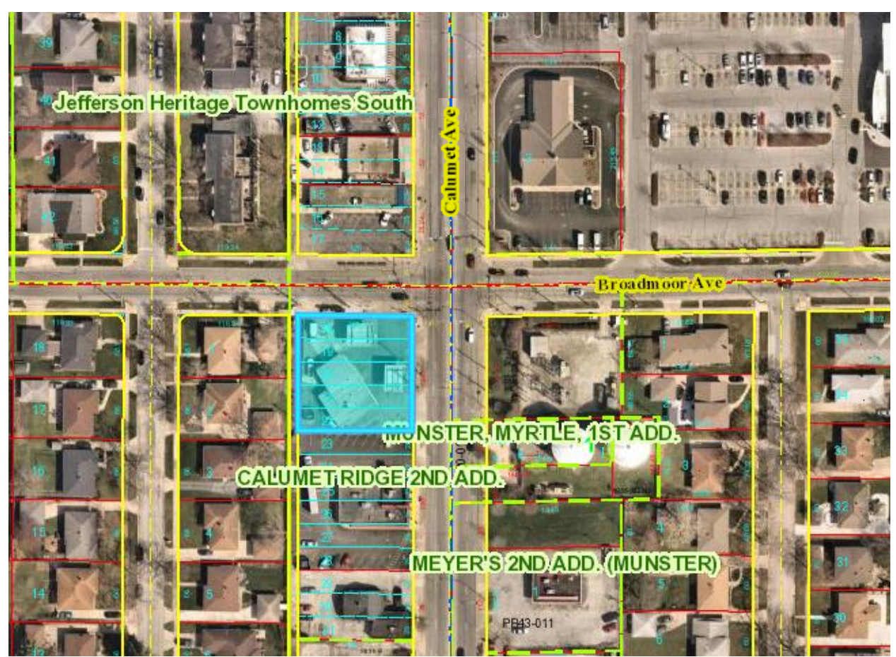
Figure 1 Subject property highlighted in blue