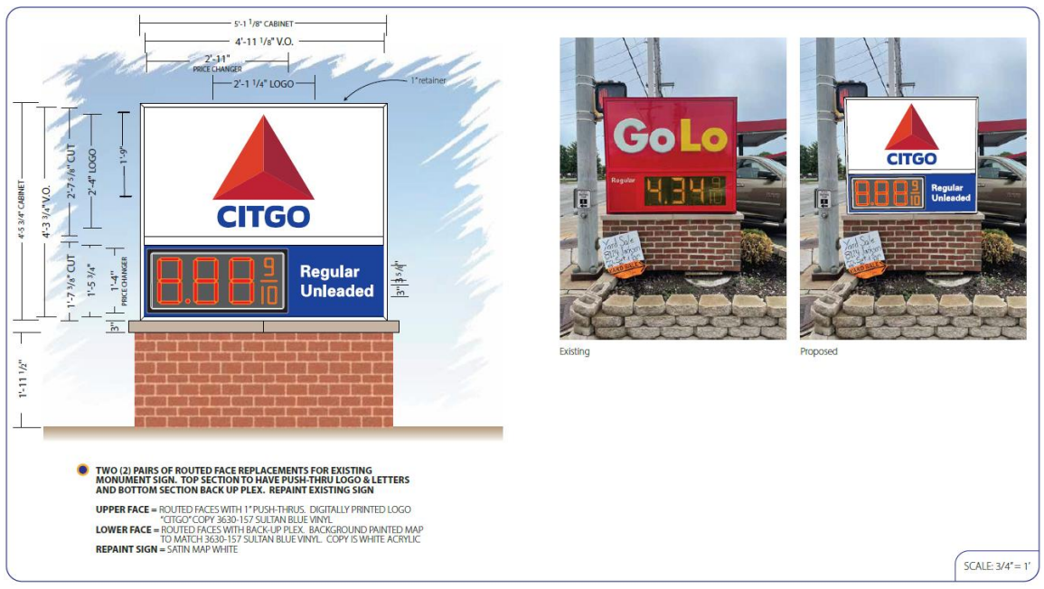
Figure 2 PROPOSED SIGN

The applicant has provided two renderings: A conforming sign that includes 8" CITGO letters and an 11'-7/8" logo and a nonconforming sign that includes approximately 6" CITGO letters and a 21" logo, which exceeds the maximum permitted height of 12". The applicant is seeking a variance to include the 21" tall logo on the sign. All other changes conform to the relevant standards.