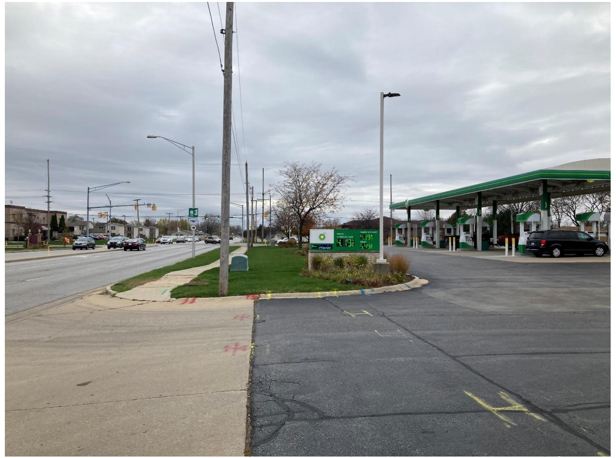
Figure 4 BP gas station at 10444 Calumet Avenue