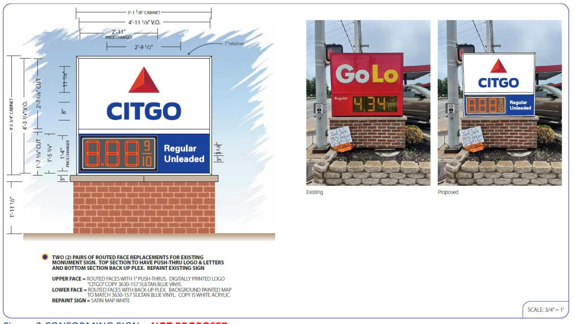
Figure 3 CONFORMING SIGN – NOT PROPOSED