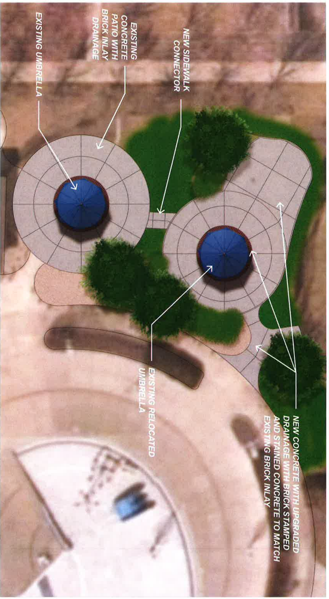
MUNSTER COMMUNITY POOL - SAND PLAY AREA REMOVAL & PROPOSED PATIO UPGRADE SEPTEMBER 19, 2022