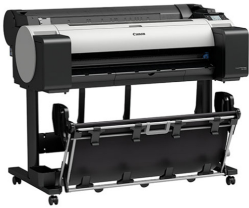
Canon TM-305 With Scanner