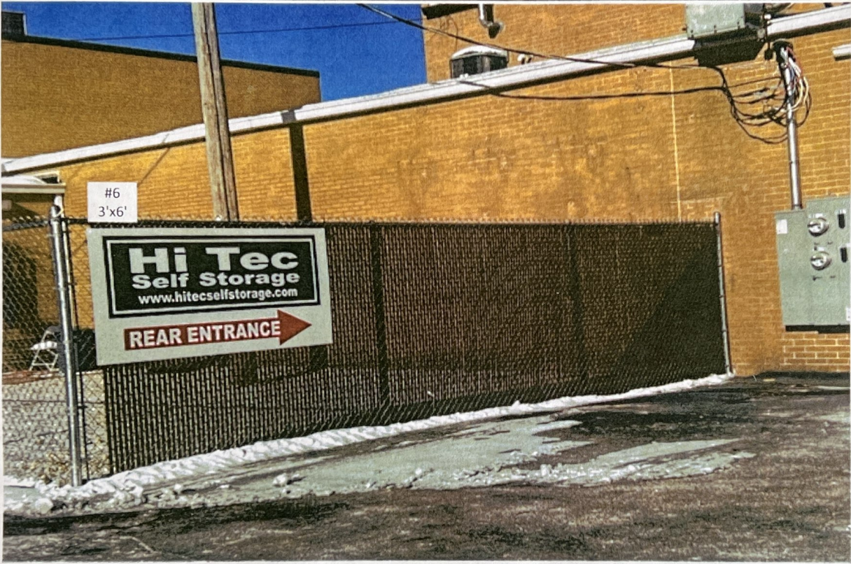
Sample Directional Signs -Off Calumet Ave