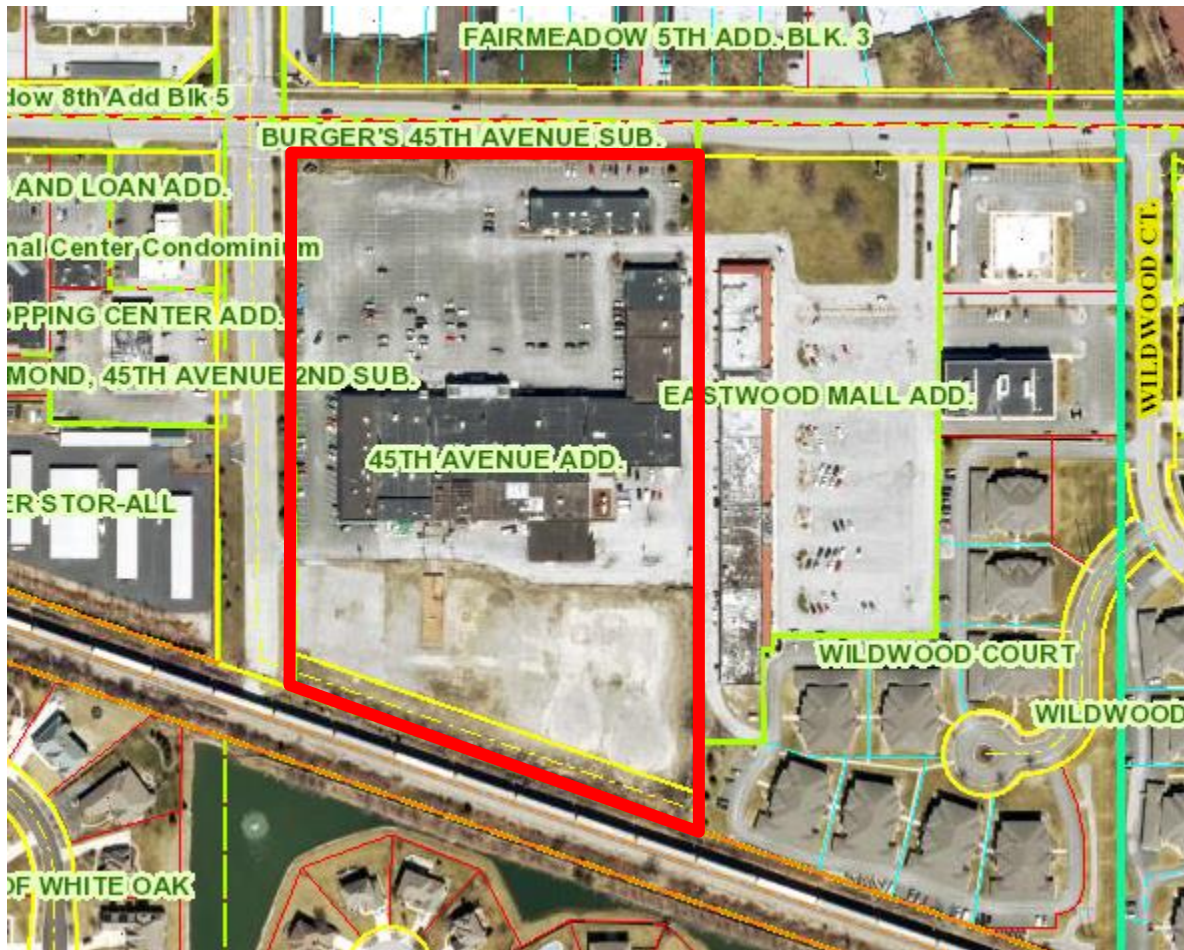
Figure 1: Subject property outlined in red.

Brian McShane of 45 th Street Properties LLC is seeking variances from the sign standards of the Munster zoning ordinance to permit additional signage to be installed at the property at 1830 45 th Street. The applicant has stated that the signage is required to guide the customers of the Hi Tec Self Storage facility to the rear entrance and to designate the rear garage and entry doors.