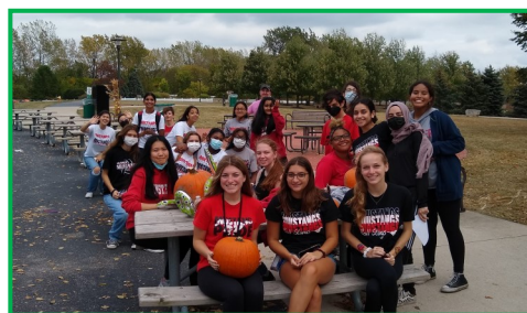
Pumpkins, Witches, & Hayrides Oh My! Volunteers 2021