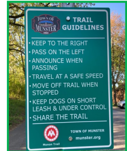
Trail Guidelines Signs 2021