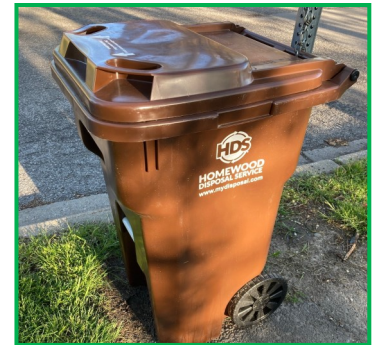
Unified Park Trash Receptacles 2021