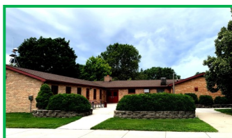
Community Park Social Center