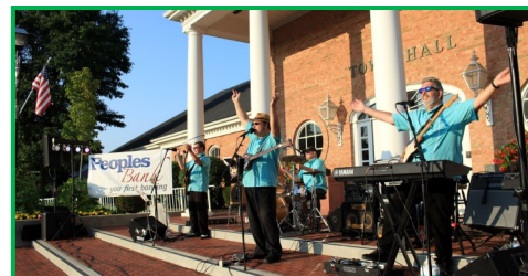
Concert Series at Town Hall 2021