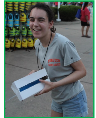
Community Park Pool