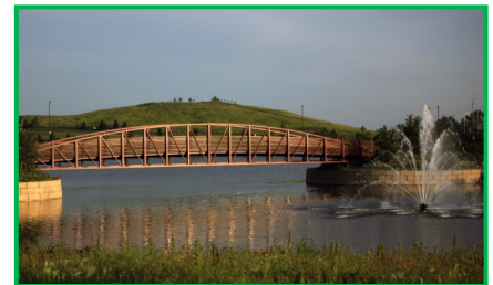
Maynard Lake at Centennial Park