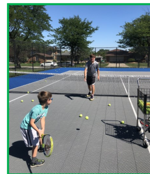
Tennis Lessons 2021