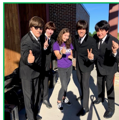
'Hey June' Concert with American English 2021