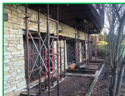
Centennial Park Clubhouse Shoring 2021