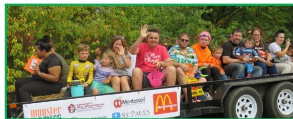
Pumpkins, Witches, & Hayrides Oh My! 2021