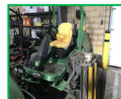
2021 J. Deere Fairway Mower 7500A