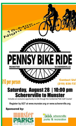
Inaugural Penny Bike Ride 2021