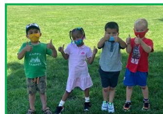
Summer Camp 2021