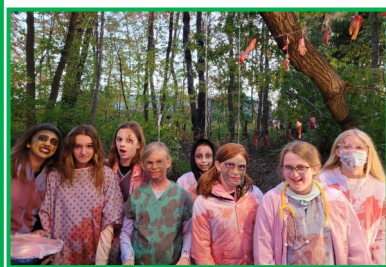
Bieker Woods Night Walk 2021