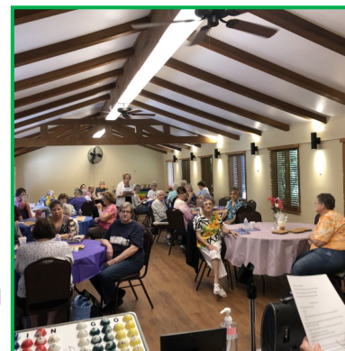
Keen-Ager Bingo 2021