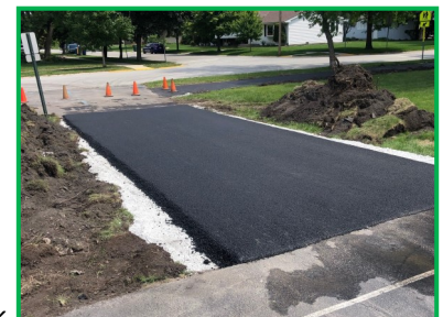
Accessible Pathways F.H. Hammond Park 2021