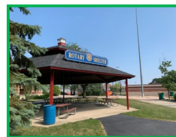
Community Park Rotary Shelter