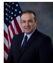
kschoon@munster.org lmellon@munster.org cgardiner@munster.org tulo@munster.org drkoul63@gmail.com wmis@munster.in.gov