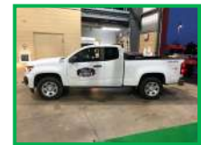
2020 Chevy Colorado