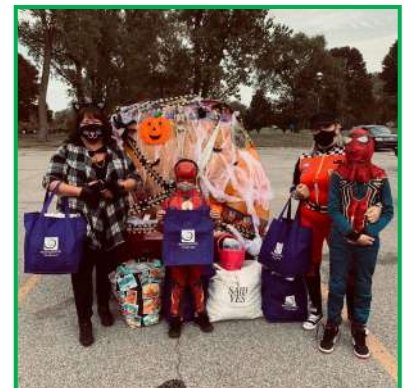
Trunk or Treat 2020

◆ NEW IN 2020: 'Walk in the Woods' took the place of 'Bieker Woods Night Walk' this year as the Girl Scouts opted out because of concerns due to the pandemic. This event surpassed expectations with 1,125 in attendance for a 2 hour event. Over 50 resident families and businesses helped carve pumpkins. Thanks to Community Healthcare System for sponsoring and making the event possible along with Great Lakes Landscaping.