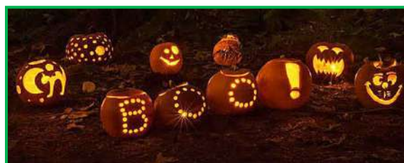
A Walk in the Woods 2020