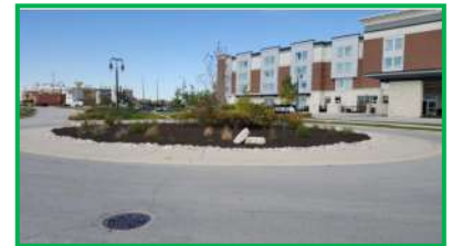
Centennial Park roundabout 2020