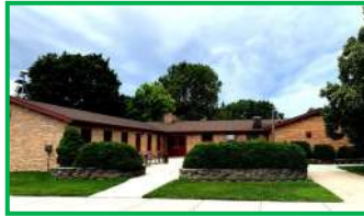
Community Park Social Center