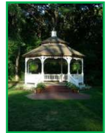
Heritage Park Gazebo