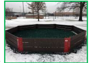
Community Park Gaga Ball Pit 2020