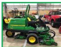
2020 J. Deere 7400A Terrain