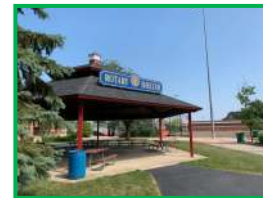
Community Park Rotary Shelter