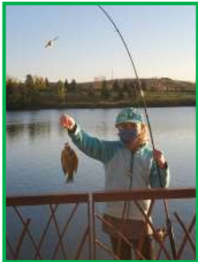
Fishing Derby 2020

that caught the most fish. The overall best fisherman caught 20 fish. It was a catch and release competition.