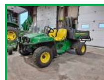
2019 John Deere Gator