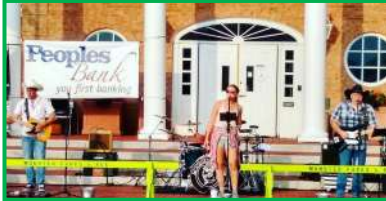
Concert Series at Town Hall

in attendance. All concerts were moved to Munster Town Hall to allow for better social distancing and was well-received by the guests.