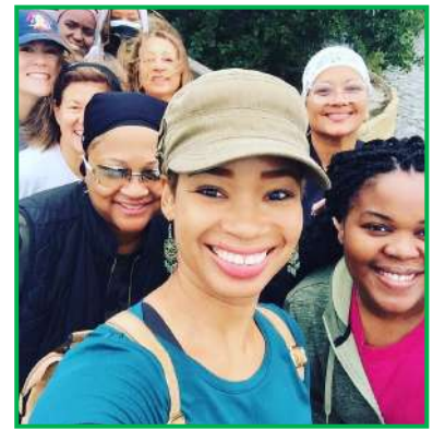
Lady Empowerment Walk