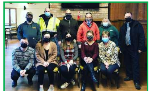
2020 Staff Holiday Party at Social Center

A HUGE thank you to the numerous volunteers that help put on so many recreation programs, activities and special events each year. Without these considerate, community oriented individuals, the program offerings would be much more limited. From National Honors Society and Project X students at Munster High School to Keen-ager volunteers, Park Pride Day volunteers, and so many more we are thankful that you are so active in your community through the Town of Munster Parks and Recreation department.