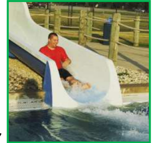
Community Park Pool