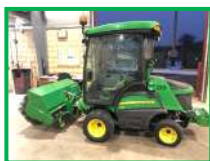
2020 John Deere 1575