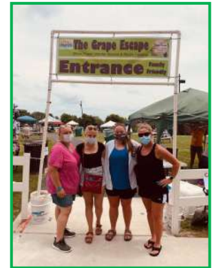
The Grape Escape 2020

in attendance. All concerts were moved to Munster Town Hall to allow for better social distancing and was well-received by the guests.