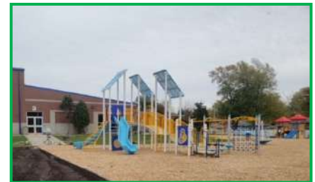
Elliott School Playground