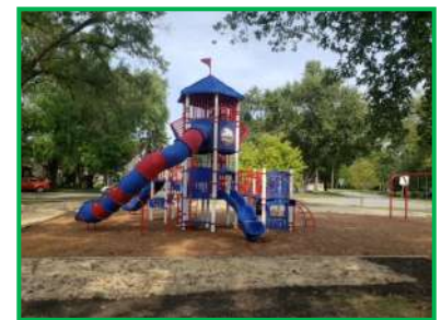
Circle Park playground 2020