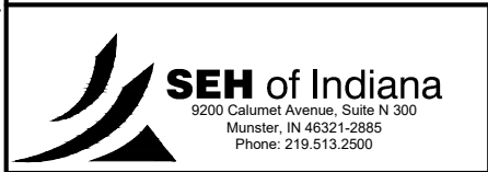
EXHIBIT NO. 1