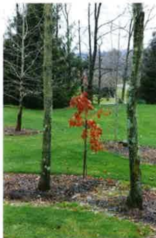
A young oak planted between two ash trees