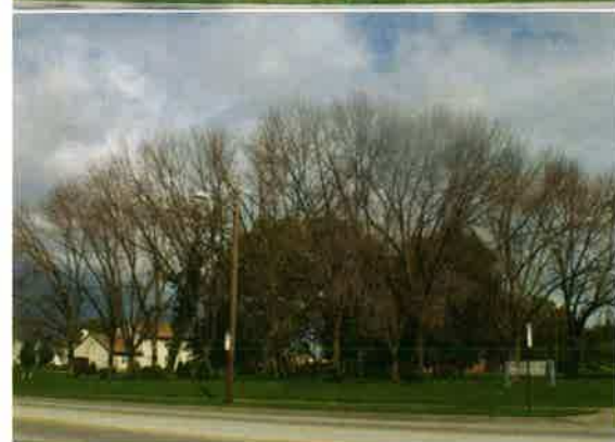
Loss of neighborhood ash trees due to EAB