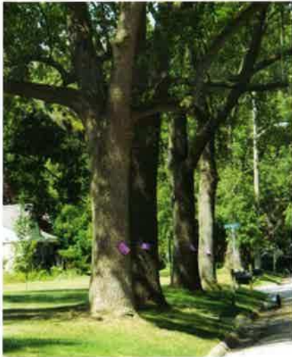
Large ash trees tagged in a West Lafayette neighborhood as part of the NABB Program

Create an ash inventory with your neighbors. Decide which ash trees are healthy, valuable, and potentially worth saving. Contact your city forester and ask if there is an EAB management plan in place.