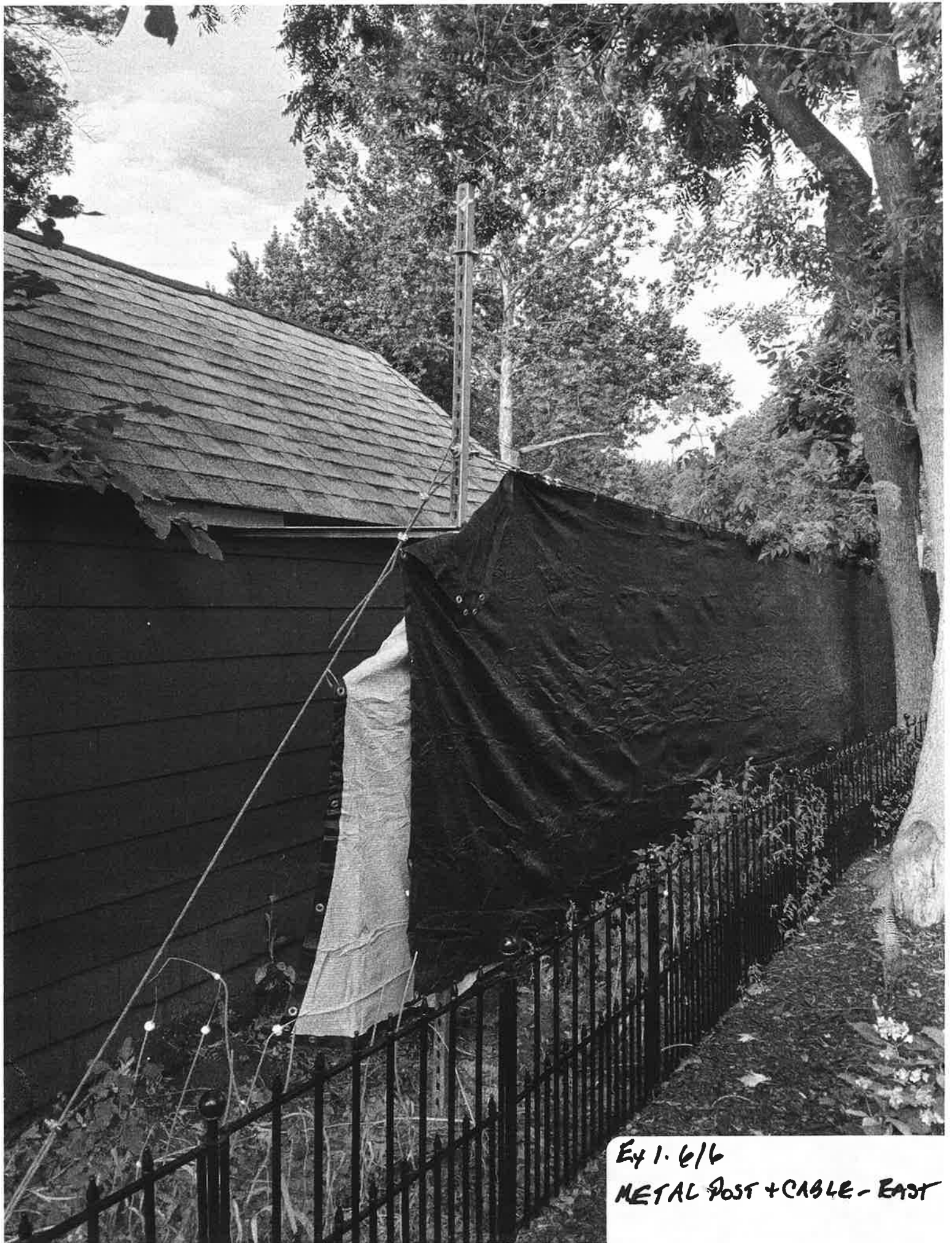
E4 1. 6/16 METAL POST + CABLE - EAST