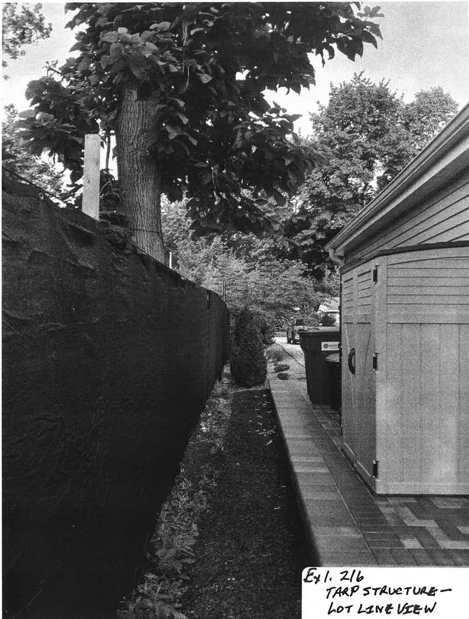
Ex 1. 216 TARP STRUCTURE - LOT LINE VIEW