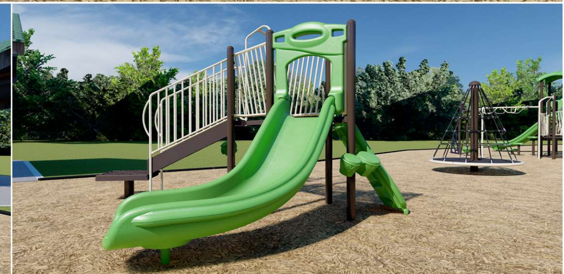
Rendered in Woodlands Palette