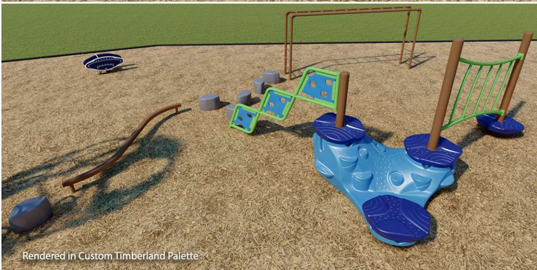
Rendered in Custom Timberland Palette