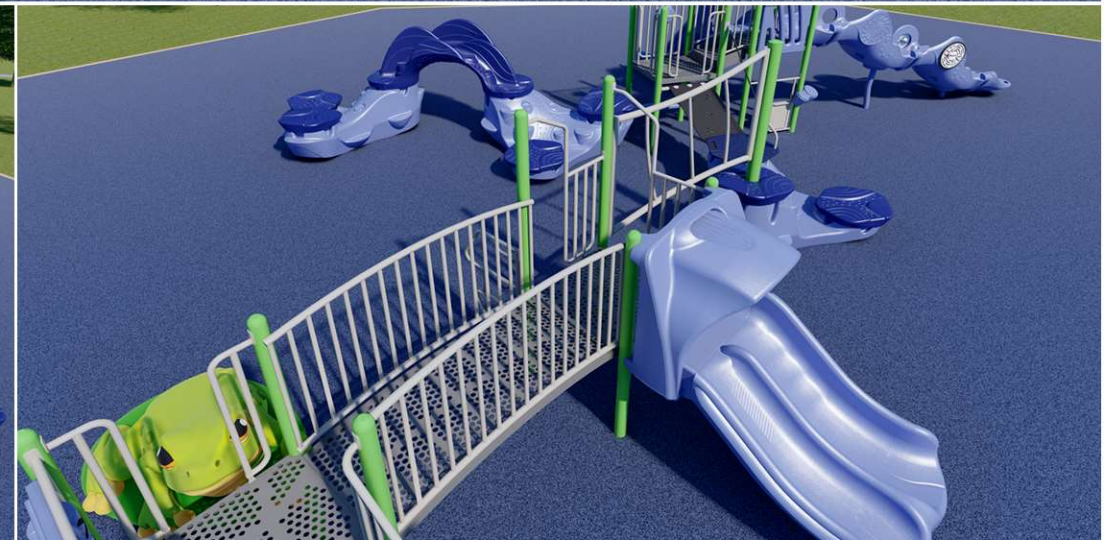
Rendered in Custom Honeysuckle Palette