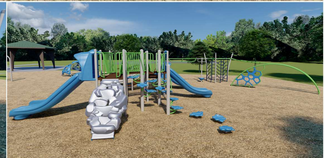
Rendered in Spring Bloom Palette