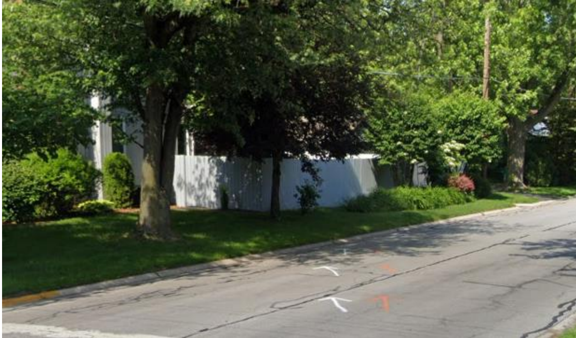
Image 3 East View of Fence.