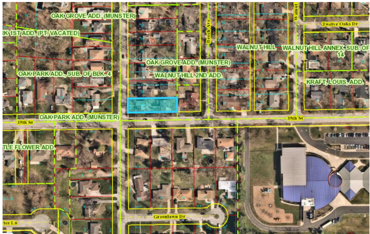
Image 1 Property Location.

A fence 11 feet south from the home would be permitted without variance approval. The Board of Zoning Appeals may consider a fence from the home to the end of the property line, which is 14 feet south from the home. However, the Board of Zoning appeals cannot grant a variance that will encroach 11 inches into the public right-of-way. Image 2 below identifies 14 feet exist from the home to the public right of way.