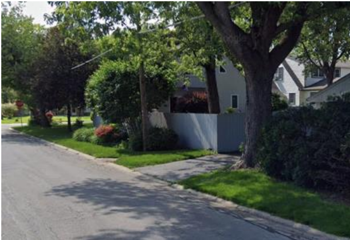
Image 3 West View of Fence.