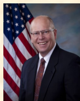
Ward #1 Ward #2 Ward #3 Ward #4 Ward #5 Clerk-Treasurer