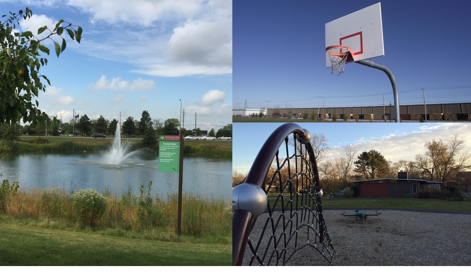
Munster Parks and Recreation 2018 Master Plan