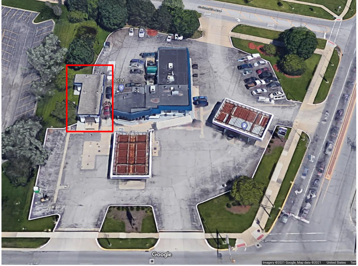
Figure 1: Subject property with proposed car wash outlined in red.