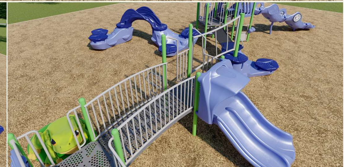
Rendered in Custom Honeysuckle Palette