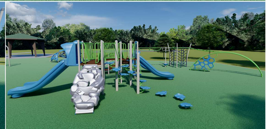
Rendered in Spring Bloom Palette