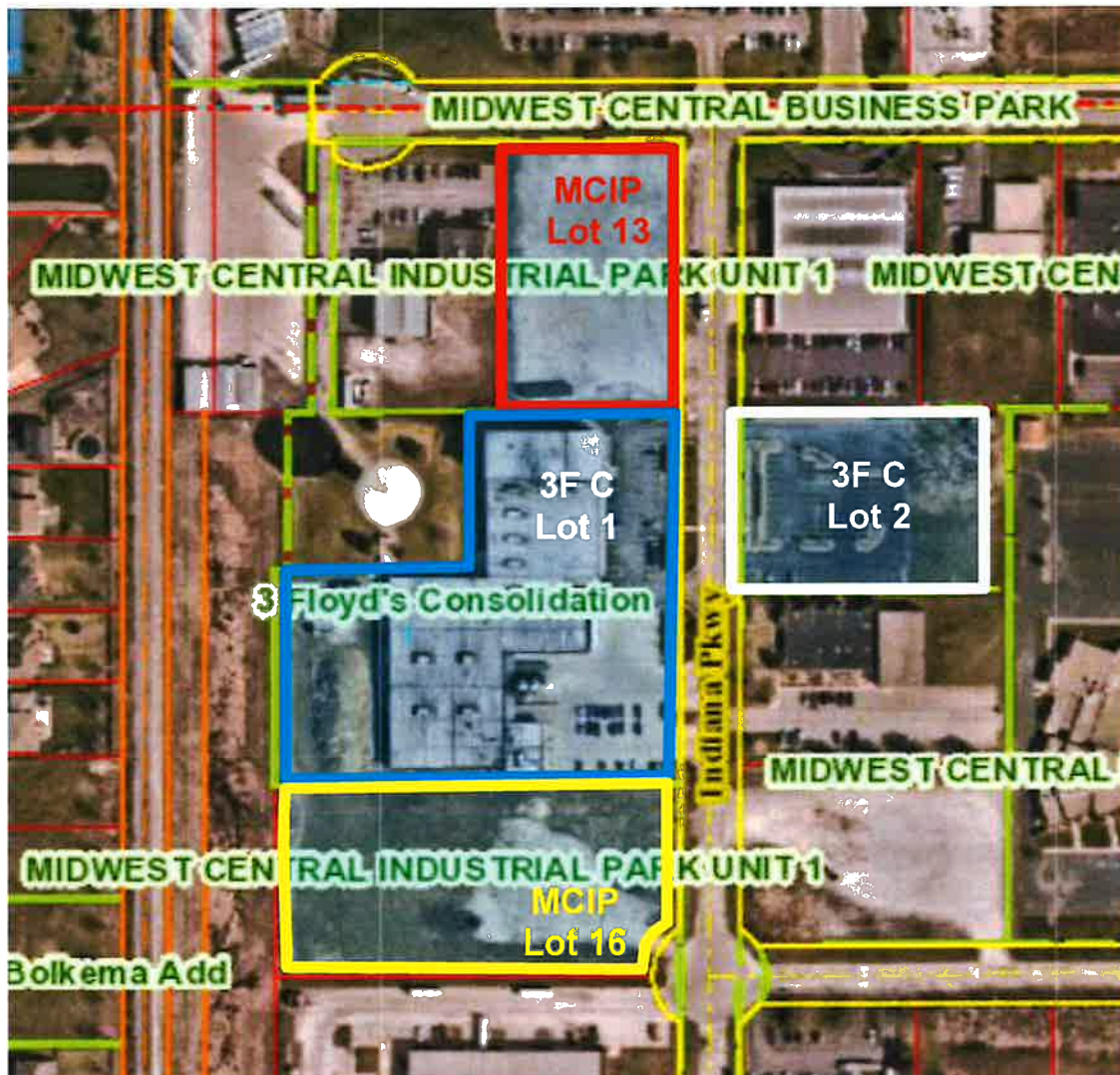
Figure 1 Subject Property.