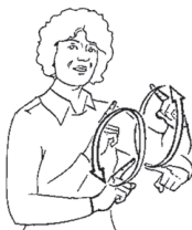
SIGN, SIGN LANGUAGE