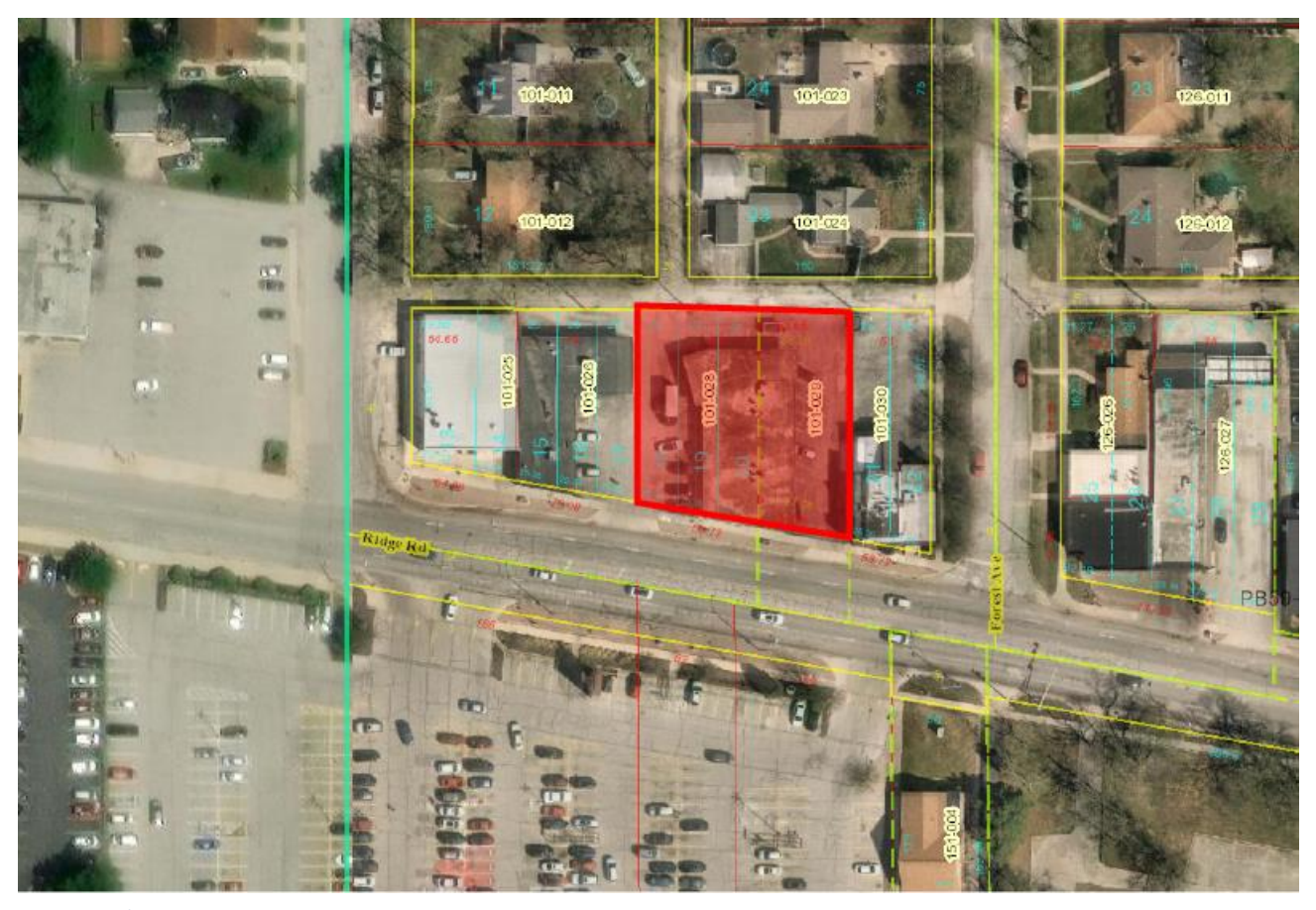
Figure 1 Subject property.