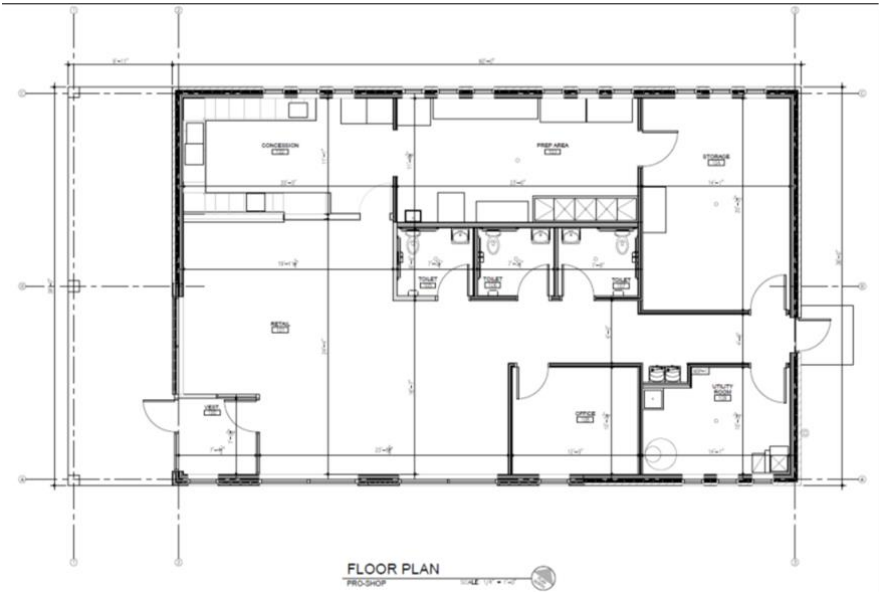
Pro Shop, 2,280 sq. ft Opened March 2025

Historically the course hosts women’s, men’s, seniors and junior leagues. The course is open to the public when leagues are not in play. The course has been the home course to Munster High School, Purdue Northwest University and T.F. South High School golf teams. The current concessions area is operated by the golf management group and includes food and beverage availability in the pro shop and on the course. The course includes a practice putting green and a practice range with mats under an extended roof line from the cart storage building and grass tees. The pro shop, patio shelter and golf cart storage garage were all opened in 2025.