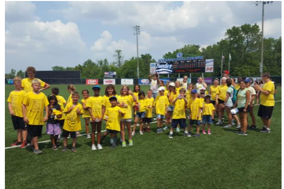
Summer Camp Field Trip