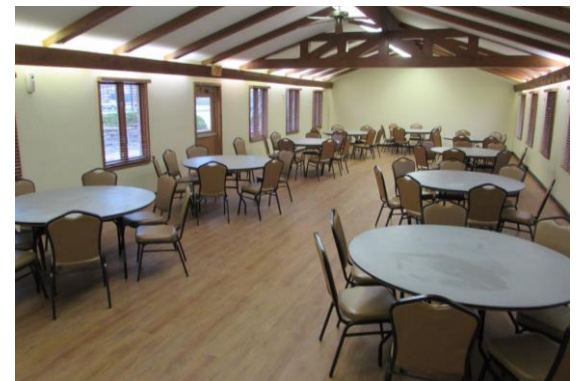
Social Center Remodel