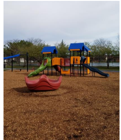
Bluebird Park Playground