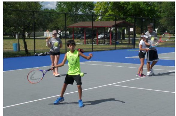
Tennis Play Day

“The Holiday Arts & Crafts Fair revenue reached an all-time high. 145 vendors participated with a net income of $20,712.”