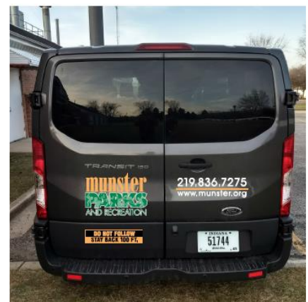
Park Van with MPR Decal