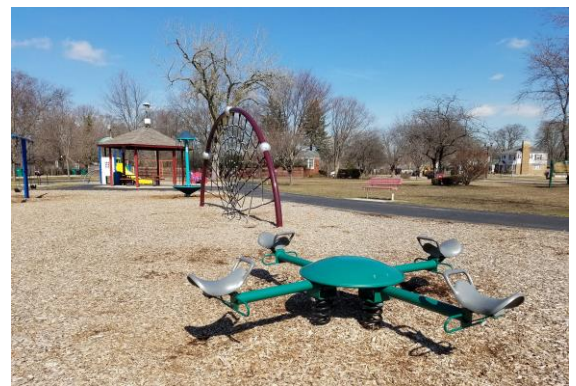
Sunnyside Park Playground