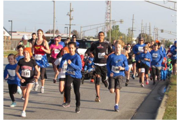
Monster Dash 5K Walk/Run