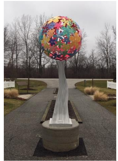
Flower Power Art