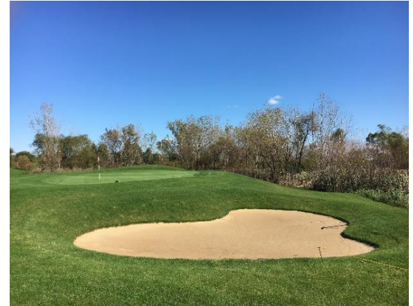
Bunker Reclamation Project