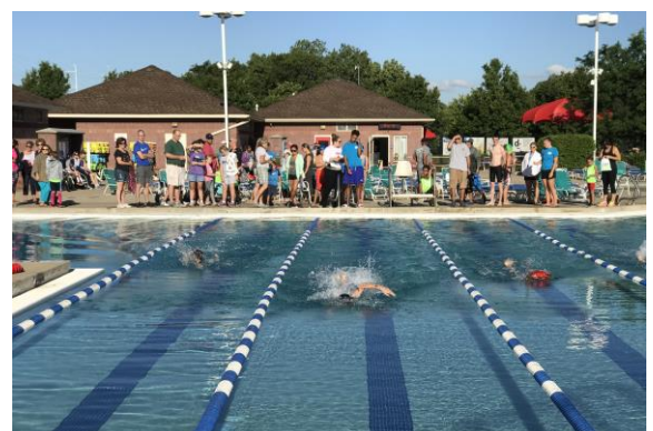
Kids Triathlon Swimming Segment