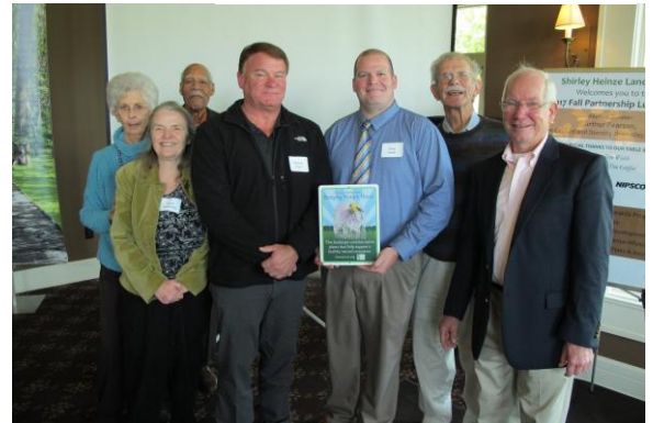
Bringing Nature Home Award