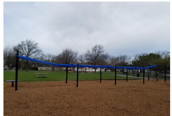
Bluebird Park Zipline