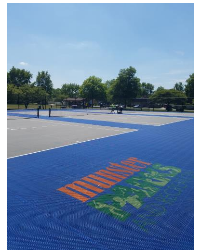
Flex-Tile Tennis Floating Court