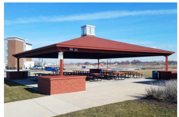
Centennial Park Shelter