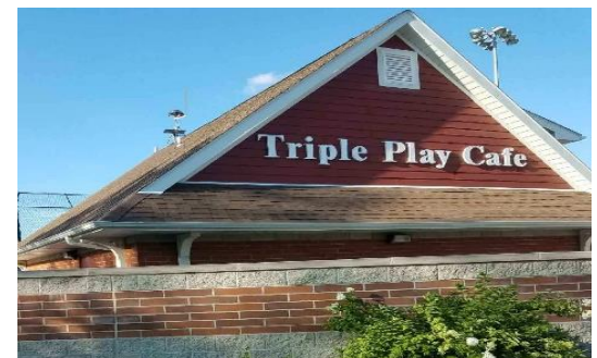
New Branding for Concession Stand