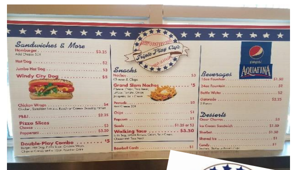
Triple Play Menu and Logo