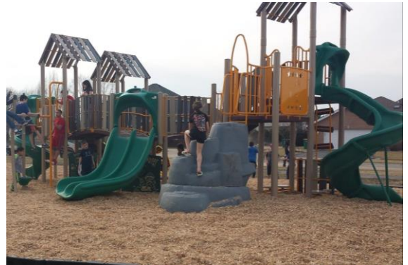
John Friend Playground