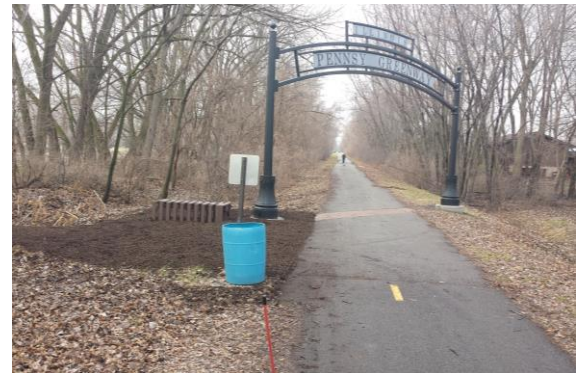
Pennsy Greenway Trailhead